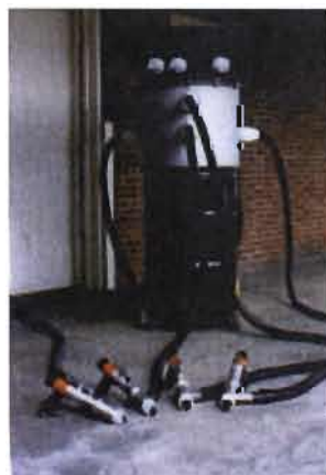
The VAC-PAC® is easily transported and provides multiple ports for multiple tool operation.