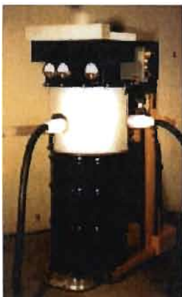
VAC-PAC® waste drums are filled and sealed under controlled vacuum.