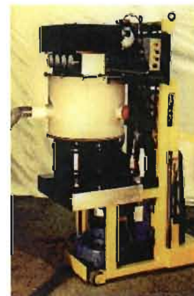
Electric-powered VAC-PACs® offer optional drawer-mounted waste drums for system portability.